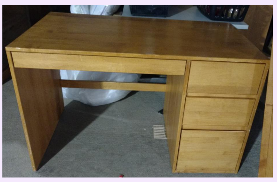
Re-purpose these free wooden desks at your school

<u>Re-Stream</u> is cleaning out dormitories and has dozens of wooden desks available for free (including delivery). If your school is interested in receiving free desks, please contact John Fantasia at Re-Stream: (781)-417-0552 or <u>ifantasia@re-stream.com</u>.