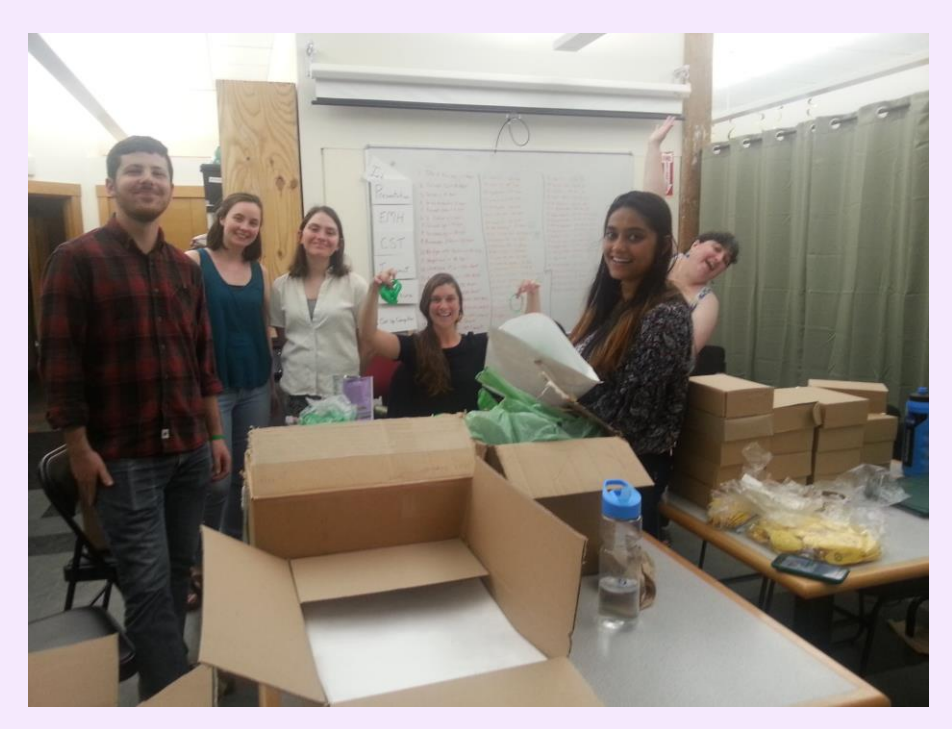
A behind-the-scenes glimpse of Green Team prize packing!