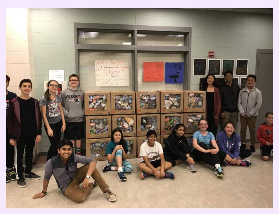
The display at Sharon Middle School, showing a week's worth of items from the trash that could have been recycled.

was eye-catching and made an impact on students who paid more attention to how they disposed of their trash and recycling in the weeks that followed.