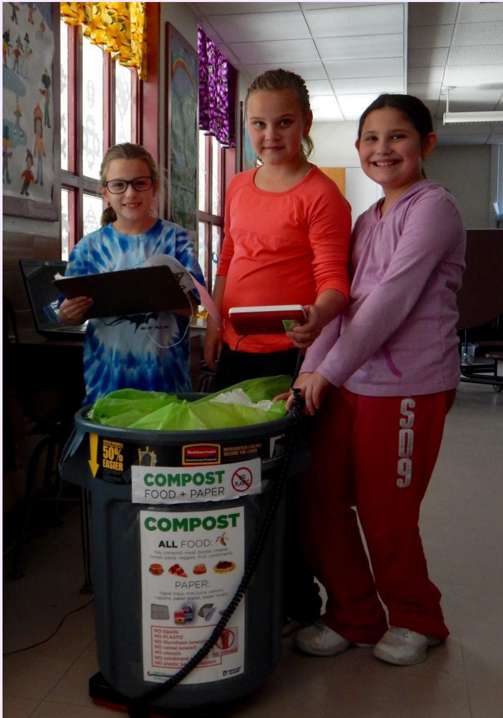
A full compost collection bin at the Discovery School at Four Corners .

Quinsigamond Elementary School in Worcester switched to plastic milk bottles in their cafeteria. Students empty the extra liquid from these bottles and recycle them. The school also held its third