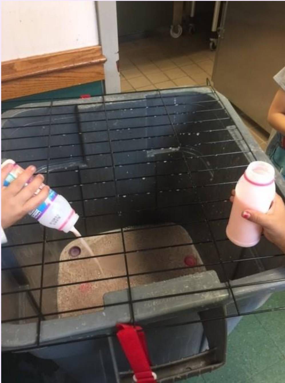
Students at Quinsigamond Elementary School empty plastic milk bottles before recycling.

annual Recycled Art Contest, as well as its third annual electronics and metal recycling drive.