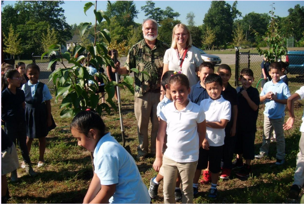
Students at Dryden Veterans Memorial School planting a peach tree.

Three schools in Greenfield started collecting food scraps in their cafeterias for composting. Greenfield High School , which also switched from disposable trays and utensils to washable ones, reduced cafeteria trash from 15 bags per day down to three! The Discovery School at Four Corners is diverting one ton of food scraps and liquids from the landfill each month. At The Math and Science Academy at Green River , 86% of kitchen and cafeteria waste is being composted. These successes are the initial results of a 3-year Sustainable Materials Recovery grant provided by MassDEP to the Town of Greenfield, with assistance from the Franklin County Solid Waste Management District , through which all the Greenfield Schools will implement composting programs.