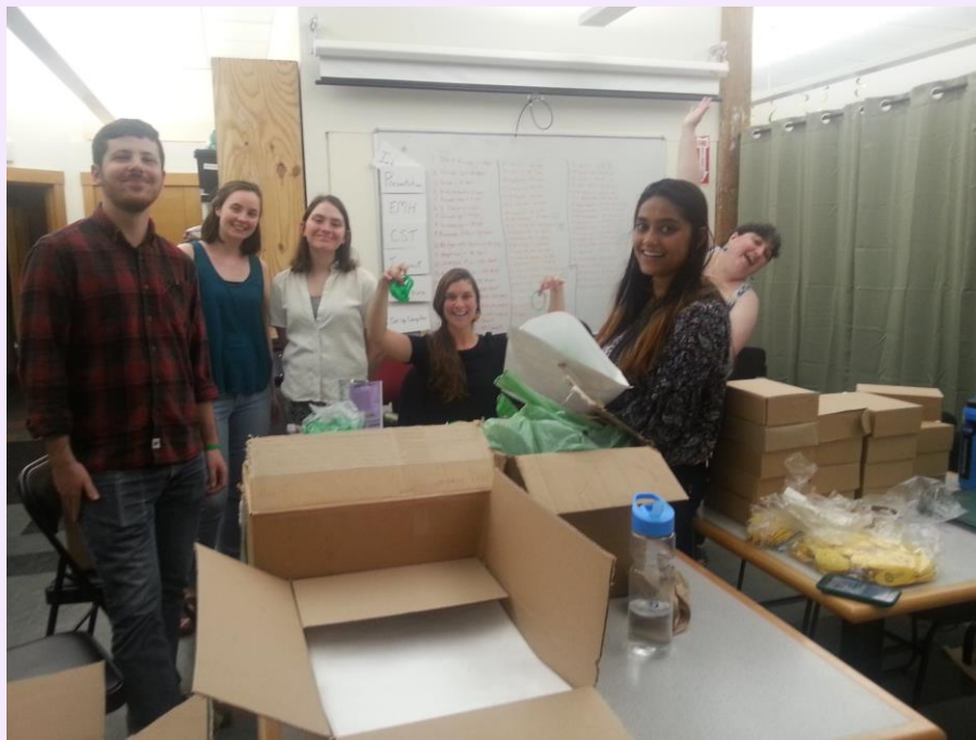
A behind-the-scenes glimpse of Green Team prize packing!