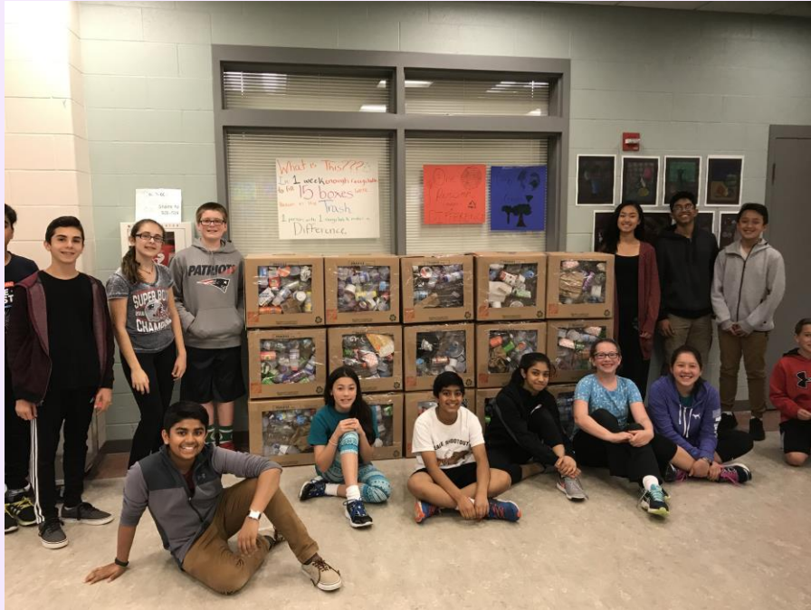
The display at Sharon Middle School, showing a week's worth of items from the trash that could have been recycled.

was eye-catching and made an impact on students who paid more attention to how they disposed of their trash and recycling in the weeks that followed.