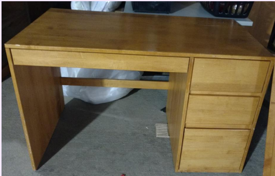
Re-purpose these free wooden desks at your school

Re-Stream is cleaning out dormitories and has dozens of wooden desks available for free (including delivery). If your school is interested in receiving free desks, please contact John Fantasia at Re-Stream: (781)-417-0552 or jfantasia@re-stream.com .